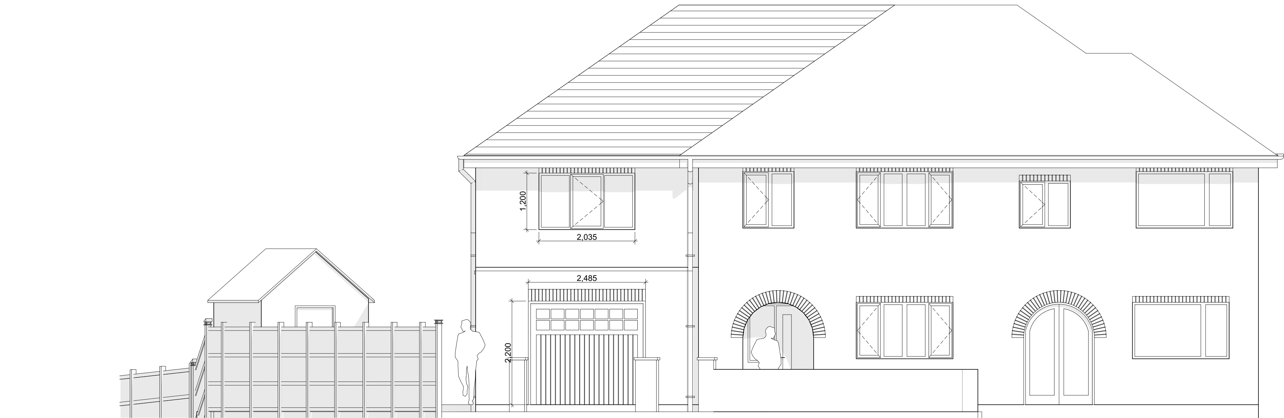
○ Front Elevation (PROPOSED) 1:100