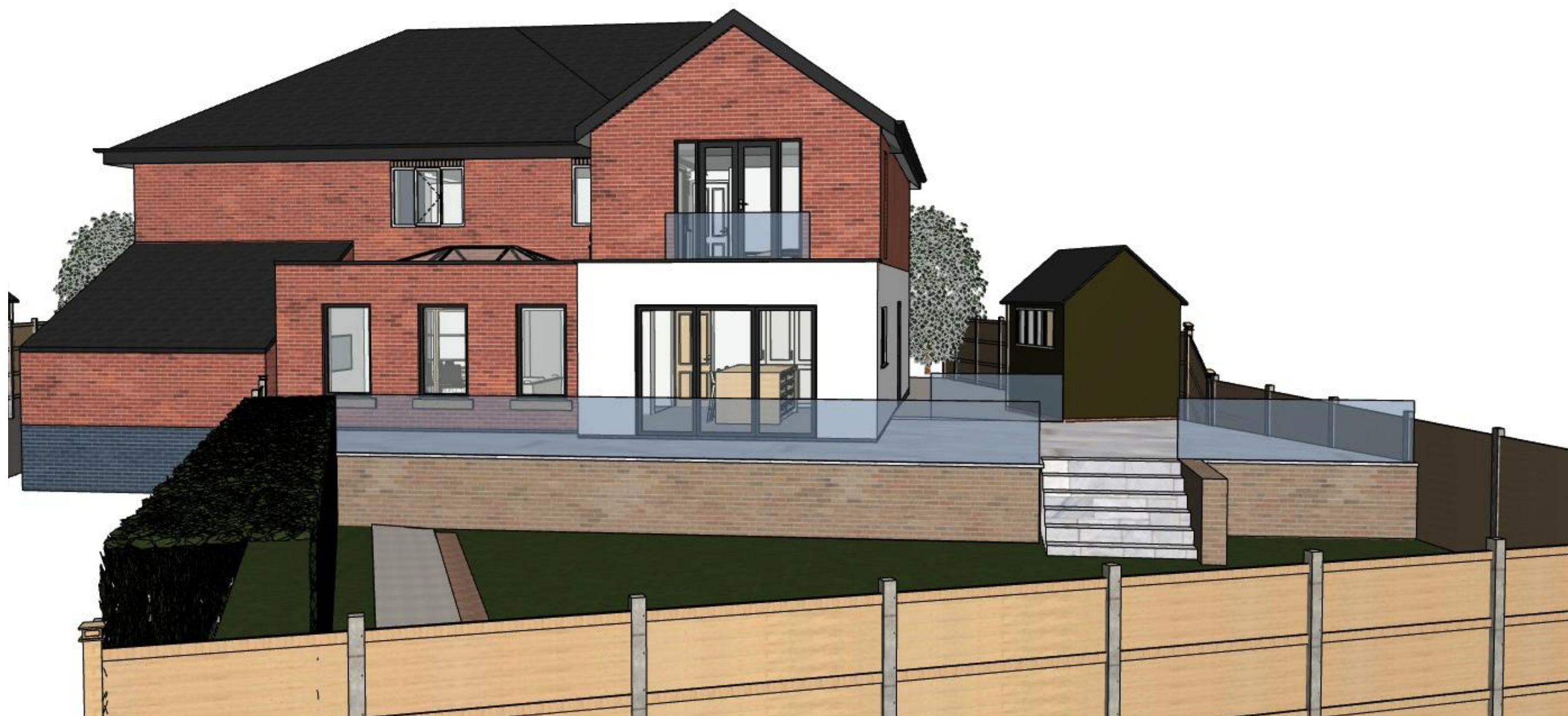
○ 3D Axo NTS This drawing, electronic file & content is copyright of IC Architecture - © IC Architecture 2017. All rights reserved. You may not, except with our express written permission, copy, distribute or commercially exploit the content. Nor may you transmit it or store it in a website or other form of electronic retrieval system.